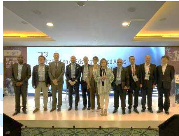
Session Organized by FAO