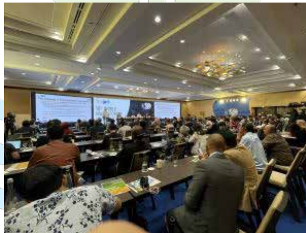
Room at Full Capacity