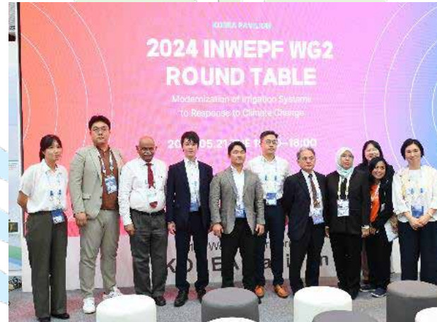
A workshop organized by INWEPF Korea Committee