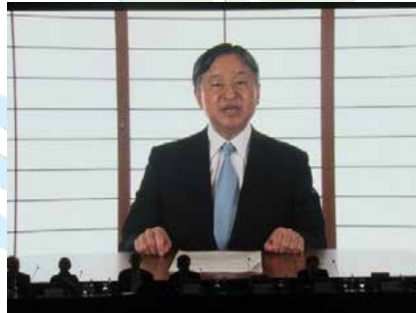
Video Message by the Japanese Emperor