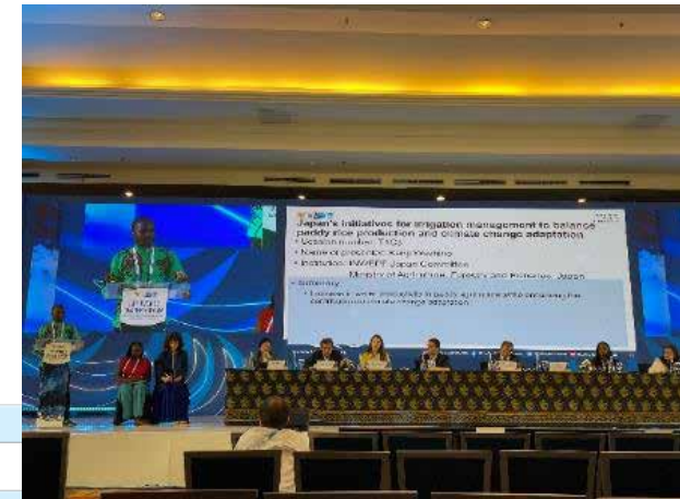
His presentation was reported during the synthesis session.