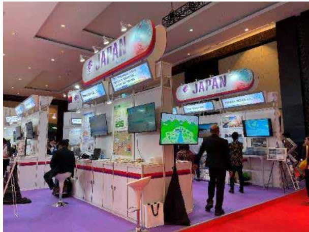
The Exhibition Booth