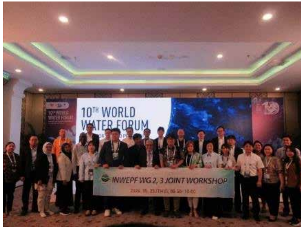
Joint Workshop by Korea & Japan